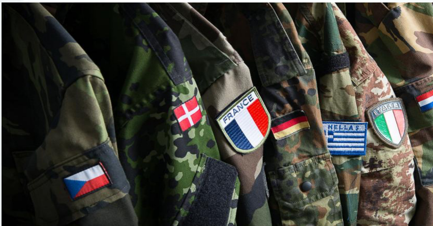
European security; the EU's strategic autonomy

It is separately emphasized that Ukraine is part of the European security space, and the EU should not allow external forces to prevent its future membership. At the same time, the effectiveness of the new strategy will be determined not only by institutional decisions, but primarily by Europe's political will to act independently.