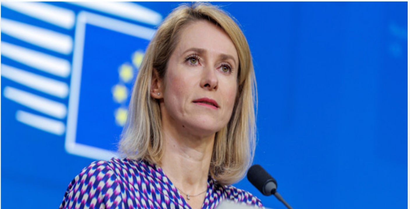
The EU's strategic autonomy; Middle East

At the same time, the author points to the possibility of forming a more independent European position. In particular, Spain's refusal, led by Pedro Sánchez, to support the war and Kai Callas' statement that this conflict is not "Europe's war" demonstrate an alternative line of behavior. The author believes that such differences do not mean weakness, but, on the contrary, precisely because of the internal discussion, the EU can move away from automatic follow-up of allies and develop a more independent common position.