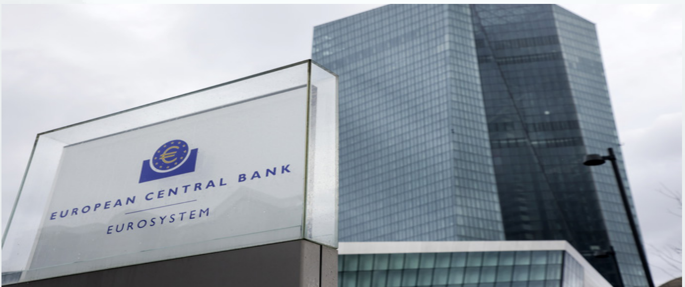
The EU's strategic autonomy; Economics, Finance

It is precisely here, in the author's view, that Eurobonds play a key role: they are intended to create a European «safe asset,» provide resources for such compensations, and reduce dependence on the dollar-based financial system.