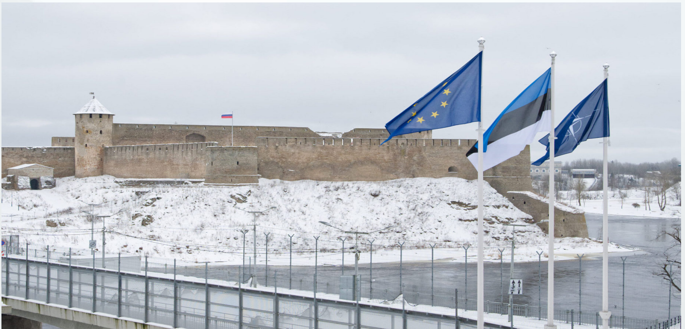
Baltic Sea region; hybrid threats

“The Republic of Narva” is currently more of an example of cognitive warfare than a preparation for real separatism, but such narratives serve the function of testing the limits of NATO’s response and the resilience of Western societies.